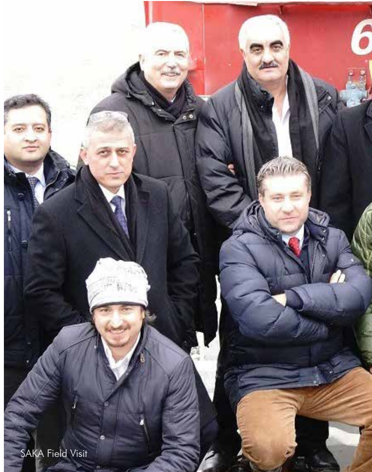
SAKA Field Visit