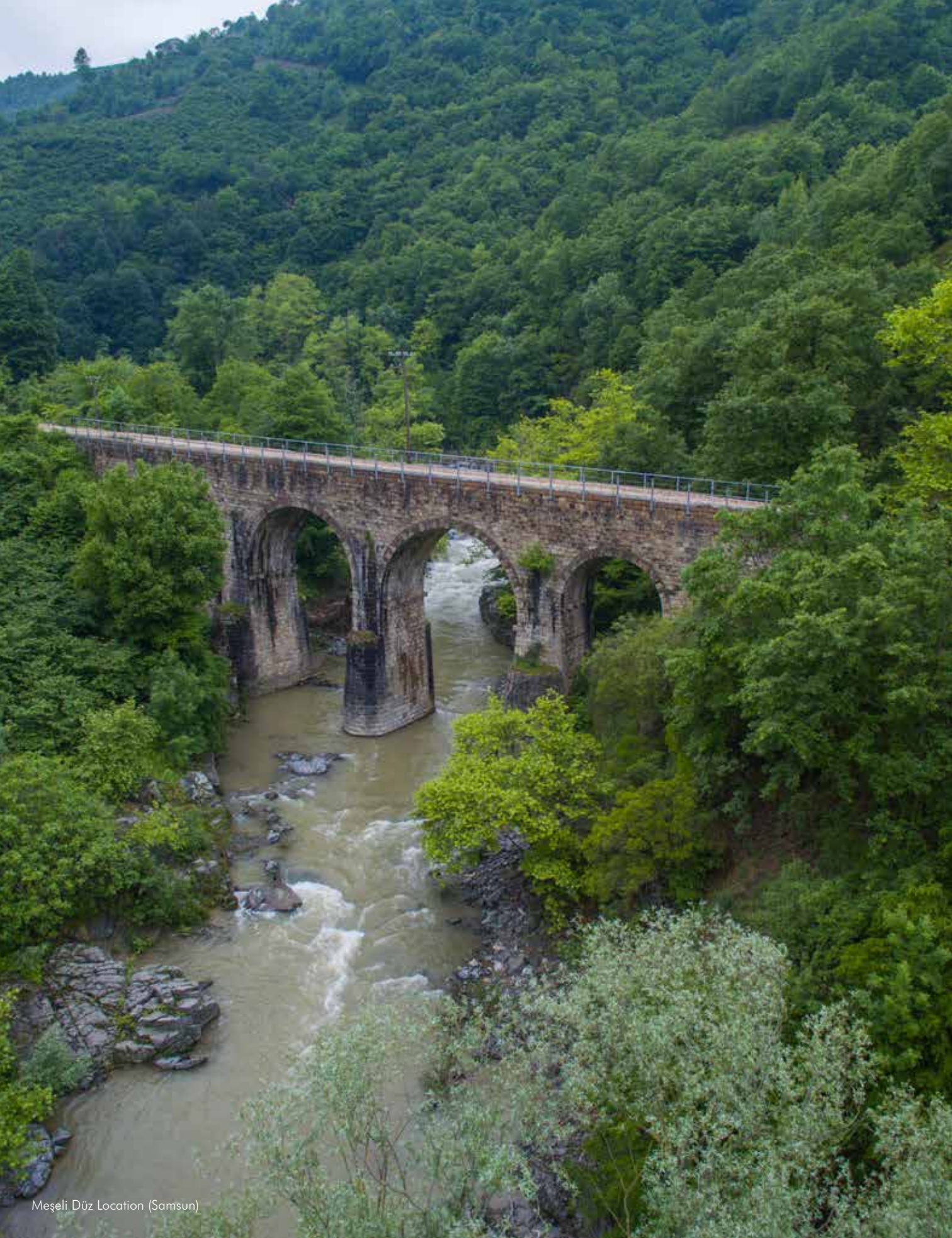
Meşeli Düz Location (Samsun)