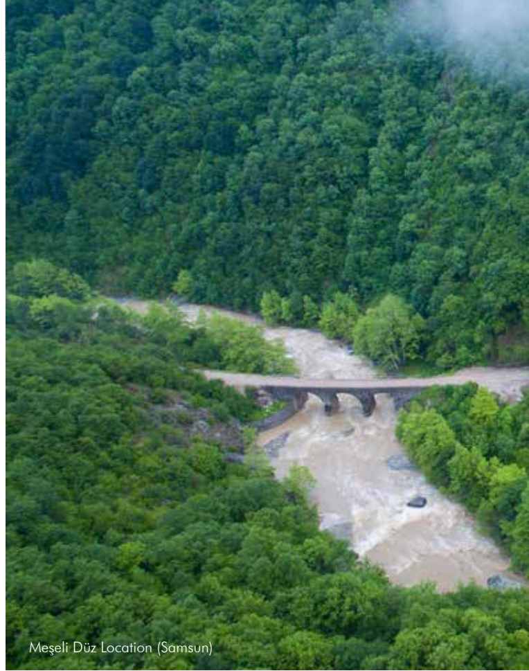
Meşeli Düz Location (Samsun)

Samsun Kalın Railway Line, which interconnects the two symbol provinces of the War of Independence - Samsun and Sivas - had been put into service in the year 1932. Thus, as the Irmak-Karabük-Zonguldak line, this line was also one of the big dreams and projects of the Young Turkish Republic, carried out in the area of transport. This line, which has a length of 378 kilometers, has been started to be renewed in