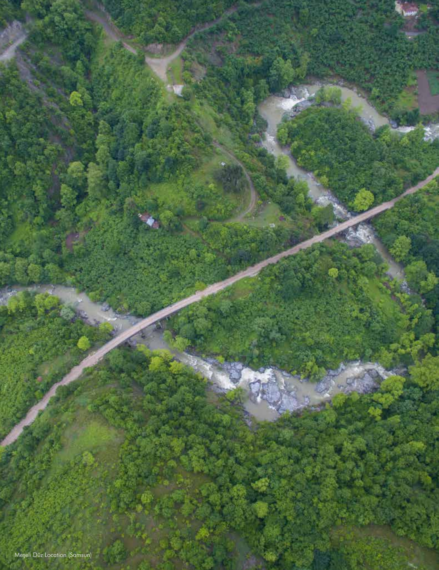
Meşeli Düz Location (Samsun)